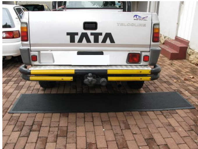
The Tags can be fitted under a vehicle

The battery life depends on the battery capacity, transmitted power and how often the Tag transmits.