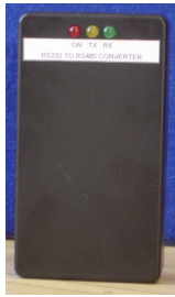
RS232 to RS485 converter.