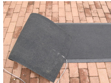
Wires moulded into rubber mat.